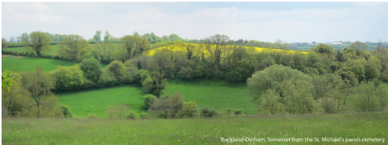
Buckland-Dinham, Somerset from the St. Michael's parish cemetery

Priscilla was born in Somersetshire, in the parish of Buckland-Dinham. 1 Teasel grown in the