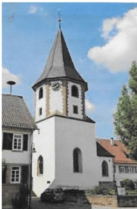
Figure 1. The Church at Botenheim, part of the city of Brackenheim, Württemberg.