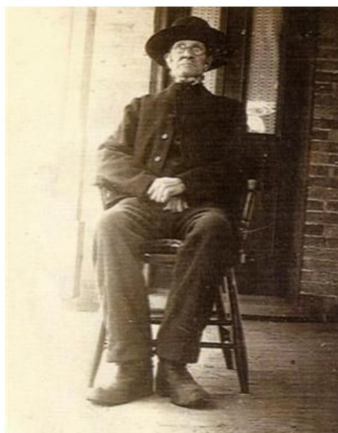
Figure 3. Rev. Jacob Hembling Woolner