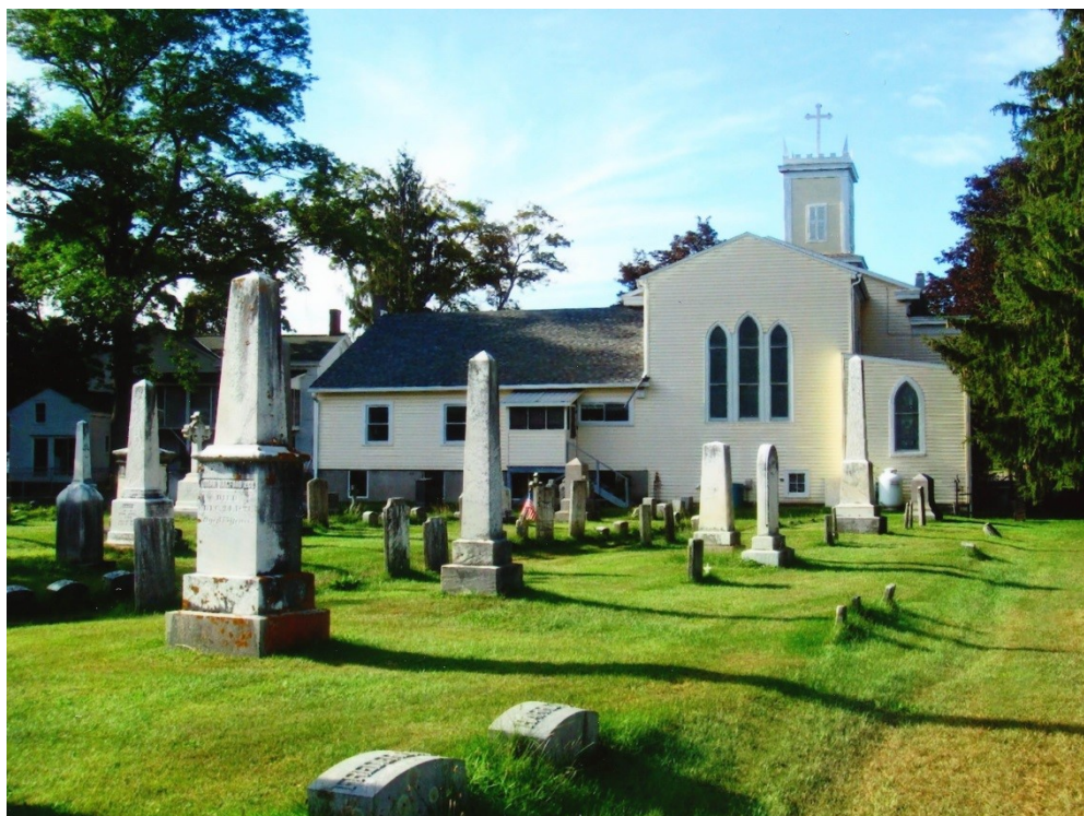
Figure 3. The Sands Plot in the Old Unadilla Cemetery, the St. Matthews Episcopal Church in the background, Unadilla, Otsego, New York