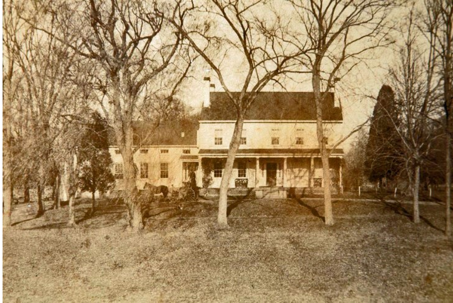
Figure 1. The Sands-Willets house in 1870, just 20 years old; the older Sands portion of the house is behind and on the left and is much older.