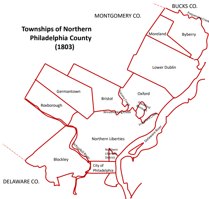
Figure 1. Northern Philadelphia County Townships 70