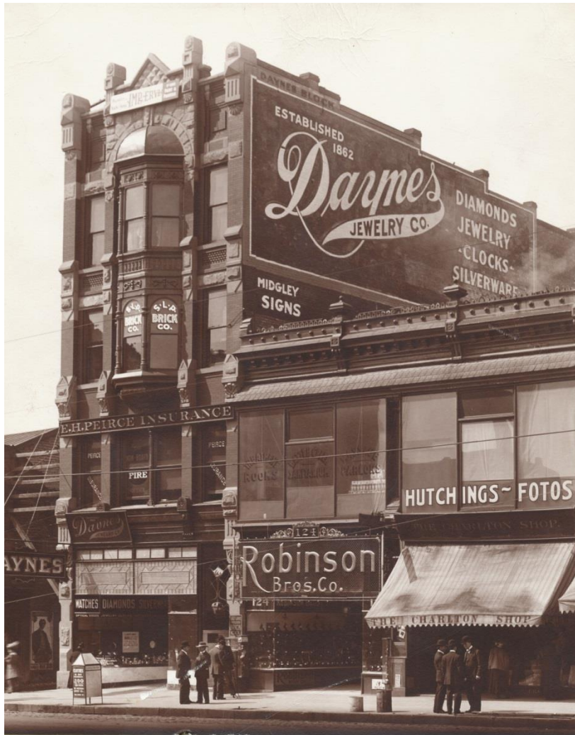
Figure 2. The Daynes Building in 1909