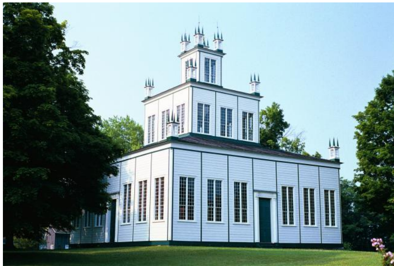
Figure 4. The Sharon Temple, erected 1825-1832 at Sharon, Ontario, Canada (online at sharontemple.ca )