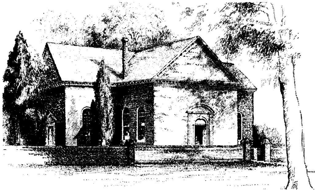
Figure 1. Abington Church, Gloucester County, Virginia. 40