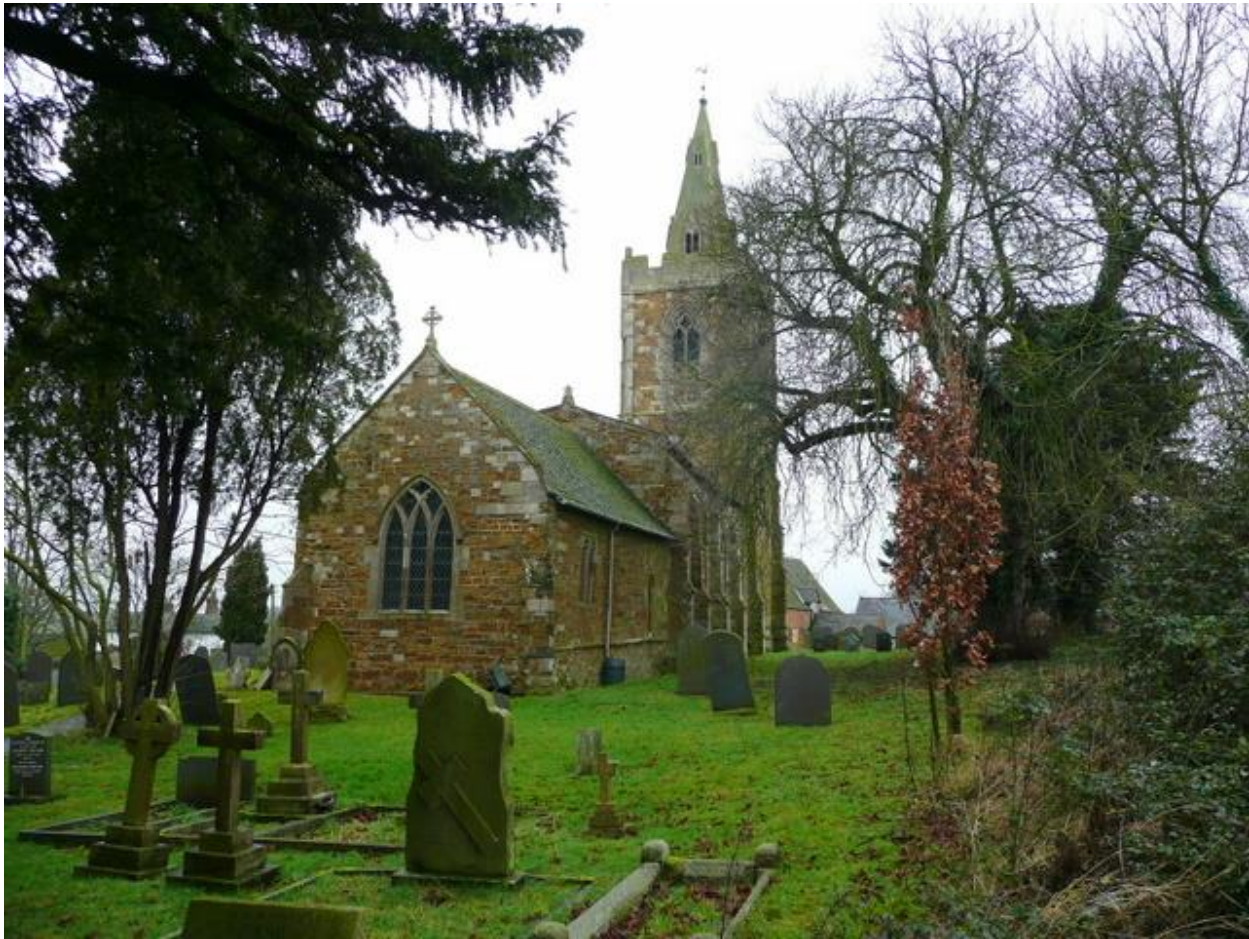
Figure 1. The St. John the Baptist Anglican Church in South Croxton (pronounced 'crow-sun'), Leicester where many of the early Wilfords were baptized, married and buried. 15