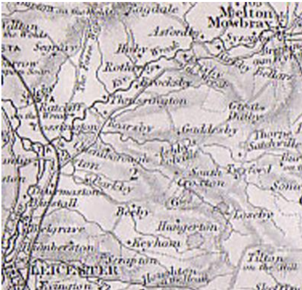
Figure 2. Central Leicestershire