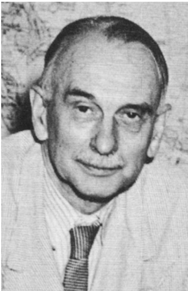
Figure 1. Richard Chace Tolman in 1945

Richard Chace Tolman, a physical chemist and mathematical physicist, was one of the great American scientists of the 20 th Century. The Southern California Section of the American Chemical Society honored him (1960) by announcing that a 'Tolman Medal' would be presented each year in recognition of outstanding achievements in chemistry. 1